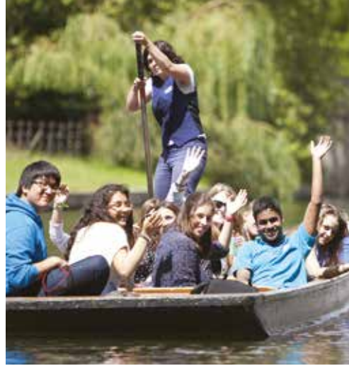
Punting in Cambridge

Brighton is always a popular visit, combining the attractions of a typical English seaside resort with the historical interest of the Royal Pavilion and craft shops of the narrow streets of the Lanes.